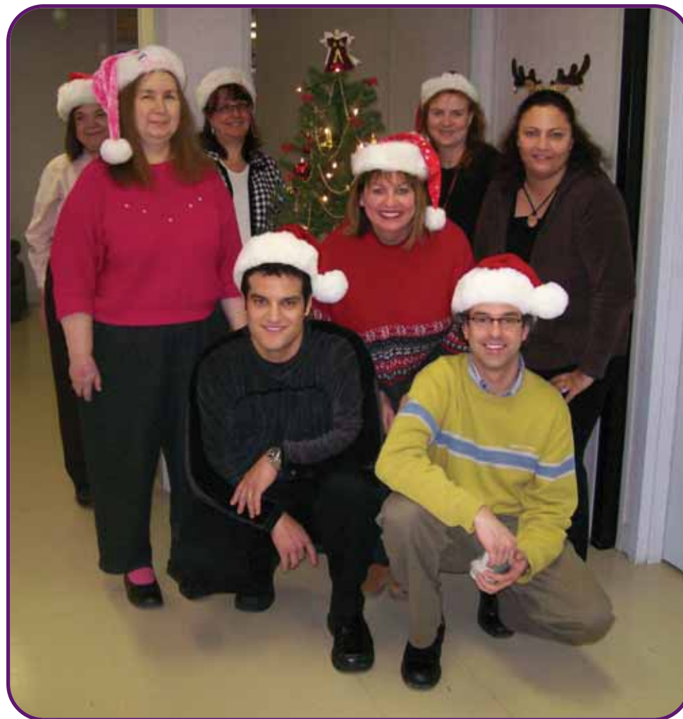
The fun staff at SMD Foundation ho ho hopes to hear from you soon.

SMD's success relies on the support of Manitobans. SMD Foundation conducts several lotteries and special events throughout the year to raise awareness and give Manitobans the opportunity to ensure vital programs and services are available when they're needed most. Many individuals also choose to support SMD through annual and planned giving, major gifts or endowments.