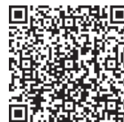
GP Web Page

*Download a QR reader to your Smartphone to access the additional information section