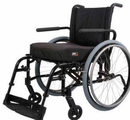
Quickie QXi featuring the Jay ION™ cushion

NOTES: (1) OPTION FOR PURCHASE (2) JUSTIFICATION