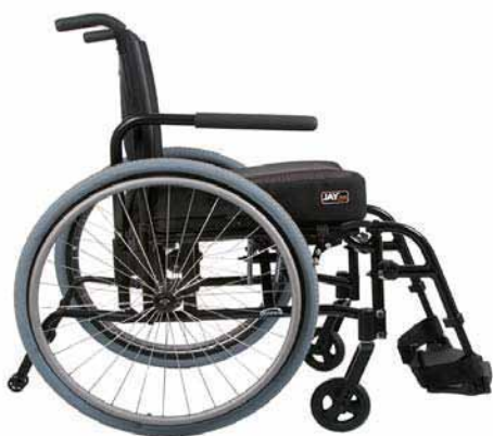
Quickie QXi, Ultra Lightweight Adjustable Folding Wheelchair